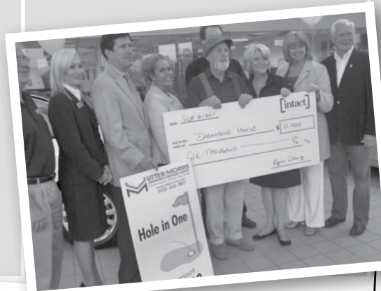
Red Green gets a new car from the Hole in One in our Keys and Tees 2011 Golf Tournament.