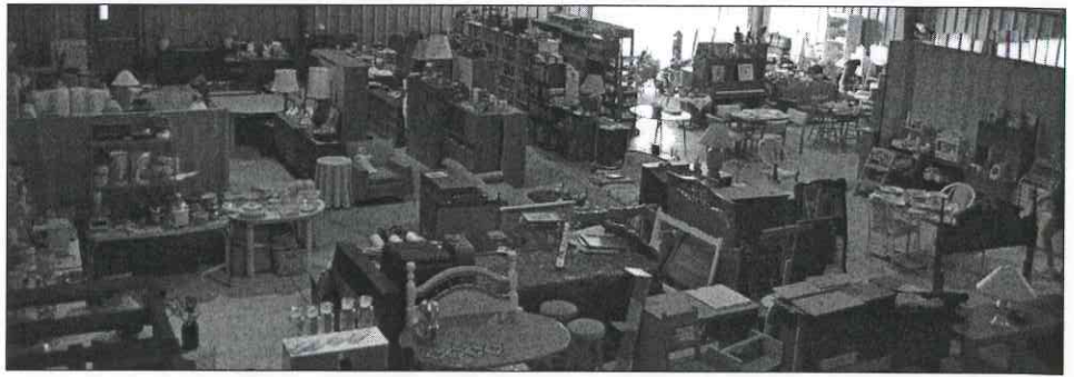
Rescued and Restored located at JDJ Trailers on Highway 6 just north of Concession 6 East is filled with a treasure trove of goods. Donations are always welcome.

Prices are quite reasonable. A highboy dresser in decent condition sells for $40.