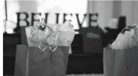
Congratulations to our two graduates.